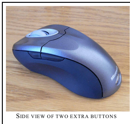
SIDE VIEW OF TWO EXTRA BUTTONS

positioning of the cursor on your screen.