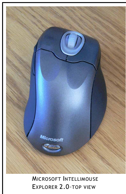
MICROSOFT INTELLIMOUSE EXPLORER 2.0-TOP VIEW

Mice come in corded and cordless models. Wireless models use a small radio receiver module to communicate with the mouse. Thus, there is no